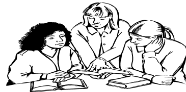
Women's Bible Study