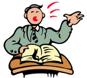
Sermons for April - May