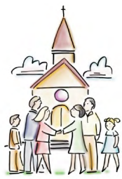
Matching Funds Drive

to give to the Matching Funds Donation . This opportunity will continue until Sunday, November 16th. We have not reached the full gift of $10,000 yet. If you are able, please consider a gift so we can take advantage of this extraordinary offer.